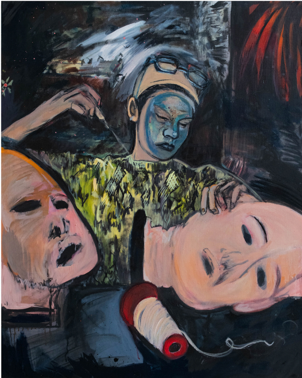
Ludvine Gonthier, Les masques , 2025, Acrylic, oil, and charcoal on canvas, 100 x 80cm