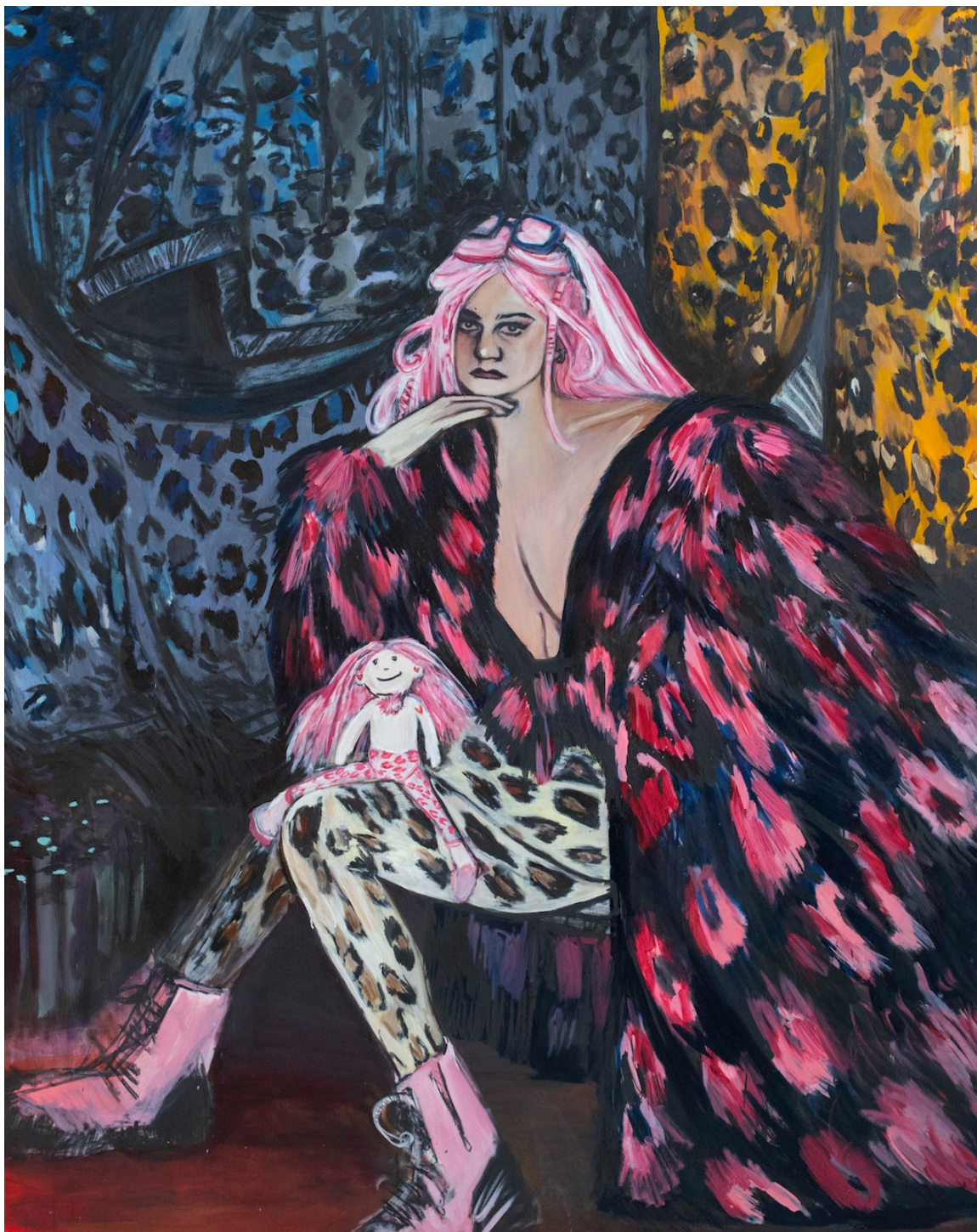
Ludivine Gonthier, Valana, 2025, Acrylic, oil, and charcoal on canvas, 162 x 130cm / Courtesy of the artist and Maïa Muller Gallery