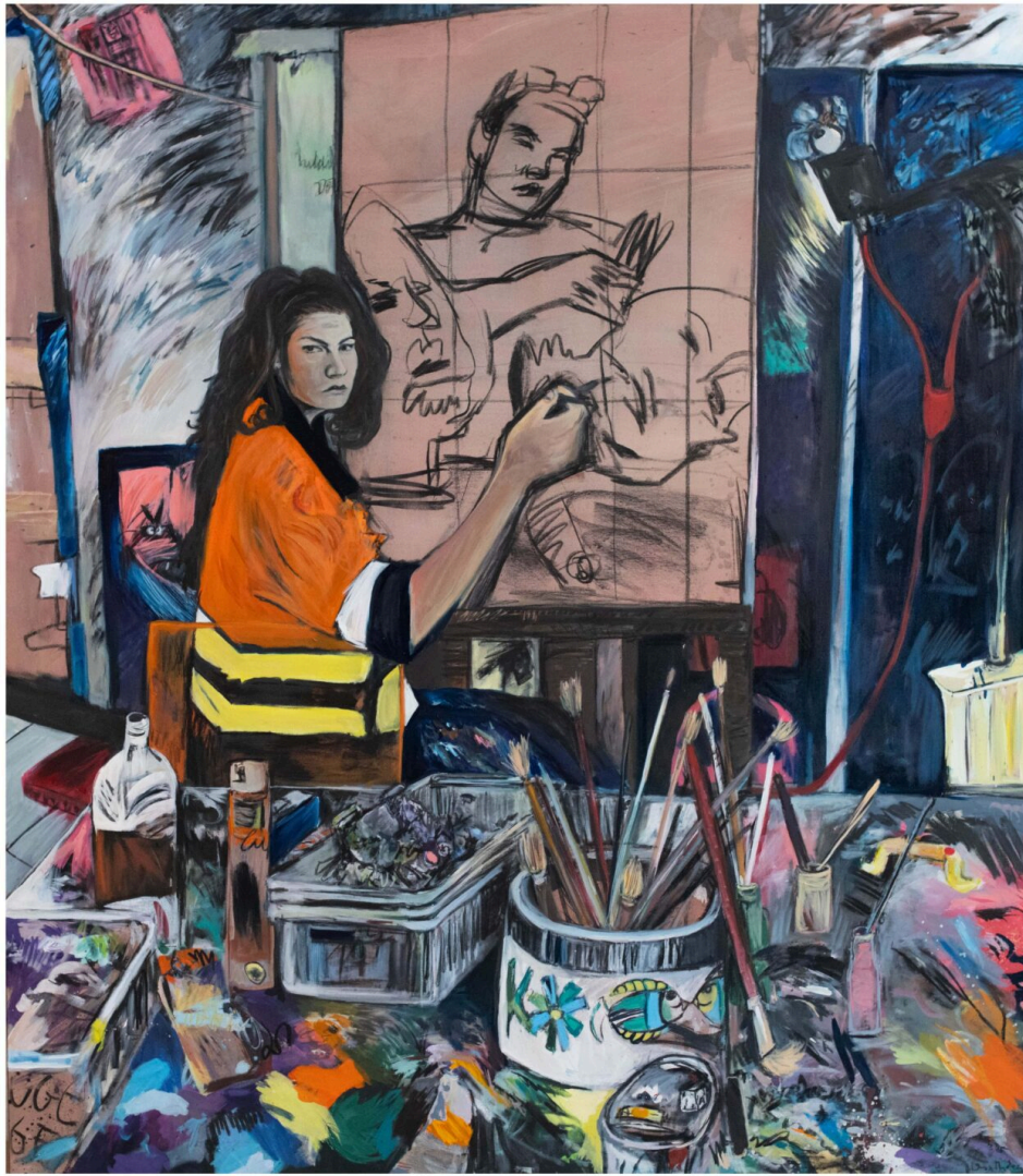
Ludvine Gonthier, 12 Septembre, 2025, Acrylic, oil, and charcoal on canvas, 160 x 140cm